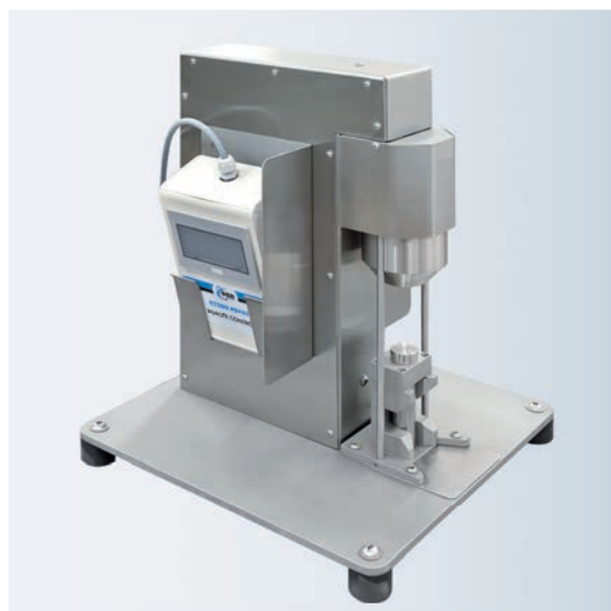
Tamping machine for sample preparation