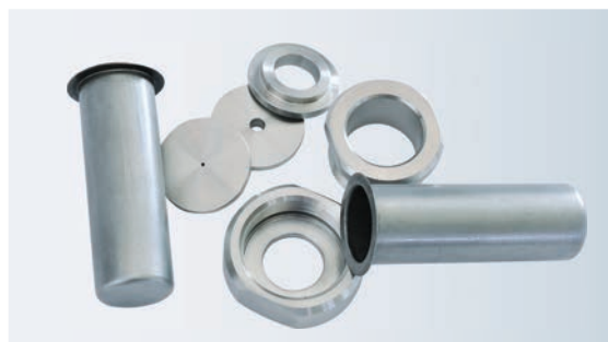
KT 300 consumables